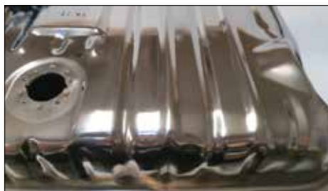
1953-54 2-piece neck