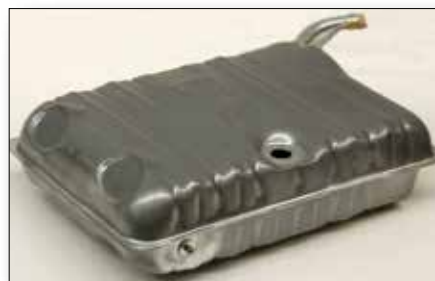
*1949-52 Tank pictured.