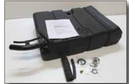
(1949-52 Tank and Hardware Pictured)

Best Value 1949-52 ORDER #1336 1953-54 ORDER #5336 Only $240 00