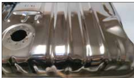
1953-54 2-piece neck